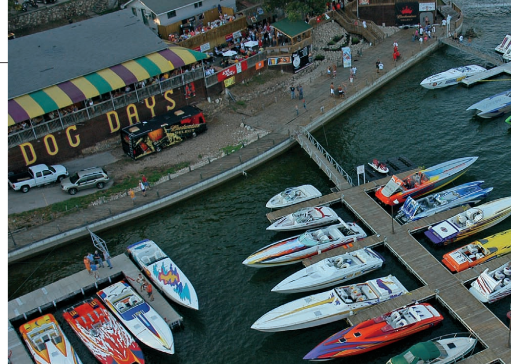
DALE BLUE'S BUD SELECT BUS AT DOG DAYS.